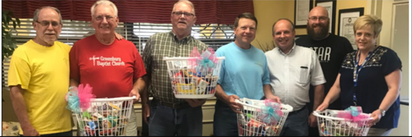
FBC reaches out to the staff of Signature Healthcare of Spencer County. More than eight baskets of snacks and candies were delivered in appreciation of National Nursing Home Week.