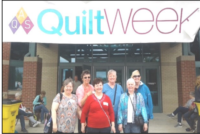
Some of the Empty Spools Quilt Friends enjoyed the day at the American Quilter's Society annual Quilt Show in Paducah.