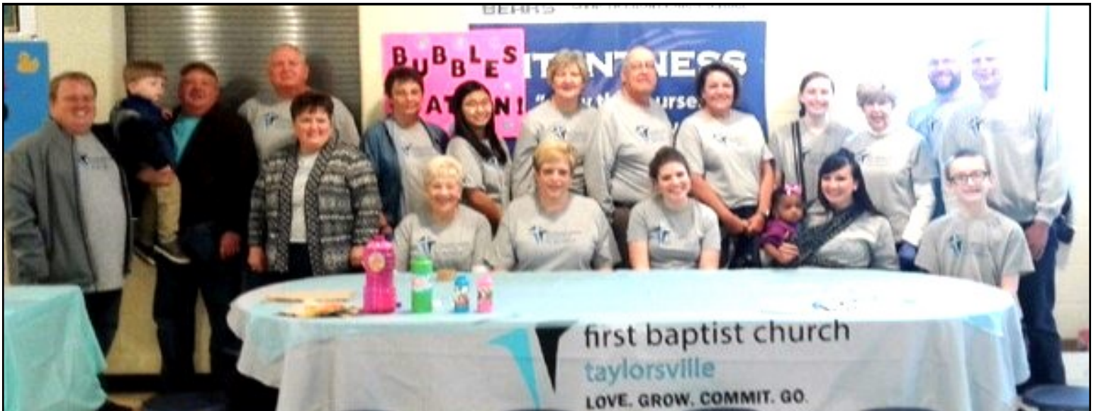
Many thanks to the volunteers who helped make the Community Easter Eggstravaganza a success!